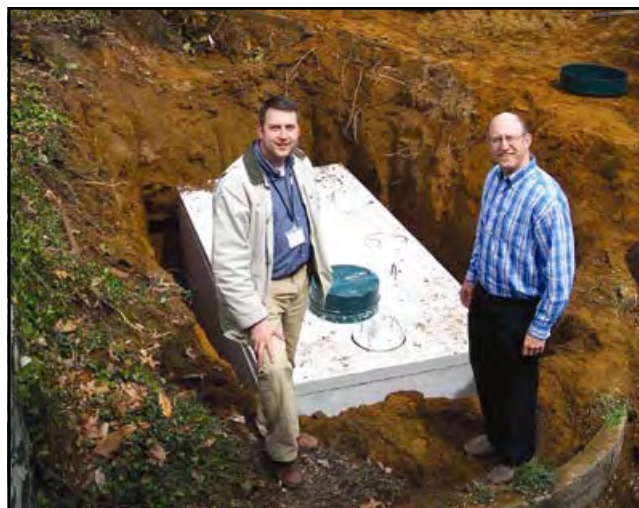
Environmental Health sanitarians assist homeowners with the application process for Bay Restoration Fund -approved nitrogen reducing units.