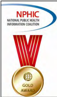
Social Media In-House Production, 2011