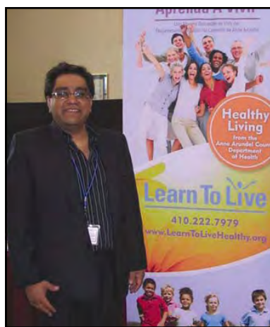
The Community Education and Health Disparities Program offers County residents information on healthy lifestyles.

Community Education and Health Disparities Program – Offers information and activities promoting healthy living to children, adults and families, including outreach to African-American, Latino-American and Korean-American communities