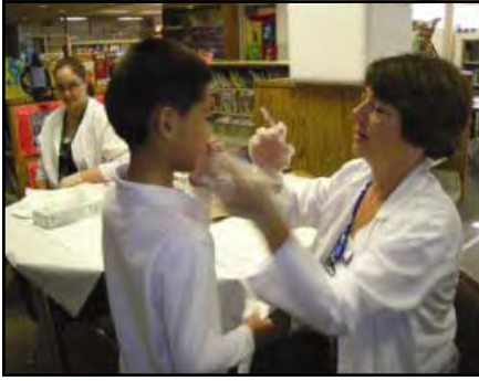
School Health nurses immunize schoolchildren with the FluMist nasal spray vaccine.