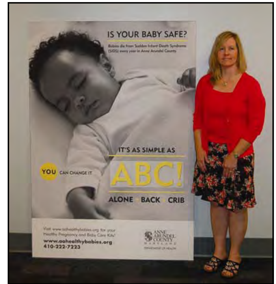
The Healthy Babies Program featured a sign about safe sleeping that was posted at bus stops in the County.