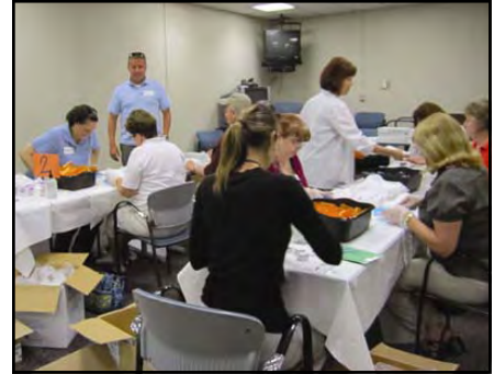
Department of Health employees prepare for emergencies with a pill packaging drill.