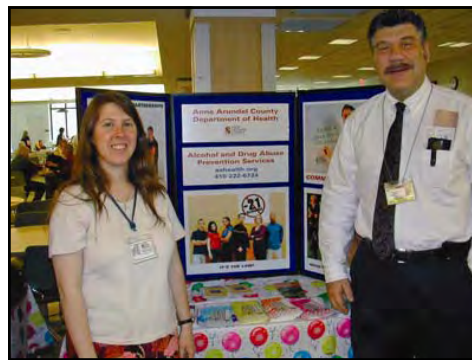
Behavioral Health programs educate the community about alcohol and drug abuse prevention.